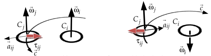
Figure 1.a. and b. Two cases of trapped light, hit by a graviton, radial or tangential, and undergoing a Coriolis effect. The orbiting graviton is deviated by the Coriolis acceleration \vec{a}_{ij} and the particle that underwent the hit, will accelerate in the opposite direction (red arrow).

The vector expression for the Coriolis acceleration \vec{a}_{ij} at the intersection \tau_{ij} is then given by: 2\vec{\omega}_i \times \vec{c} = -\vec{a}_{ij} (1) wherein \vec{c} is the translation velocity of the graviton.