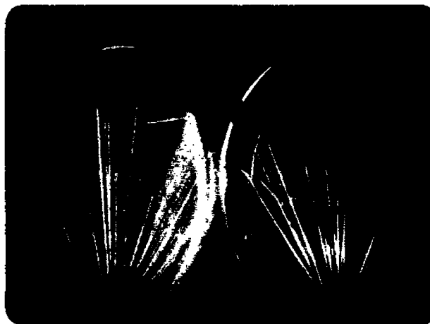
FIG. 1.—Simultaneous views at right angles of Wilson cloud tracks. In the original negative the track of the H^+ -particle has about one-tenth the intensity of that of the \alpha -particle or of the oxygen of mass 17. The disintegration is shown at the left side of each of the two views, but is much more distinct in the right-hand view.

Fig. 1 is from a photograph which was presented to the National Academy of Sciences in April 1926.